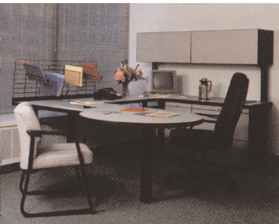
Light laminate with black PVC edge creates a striking contrast.