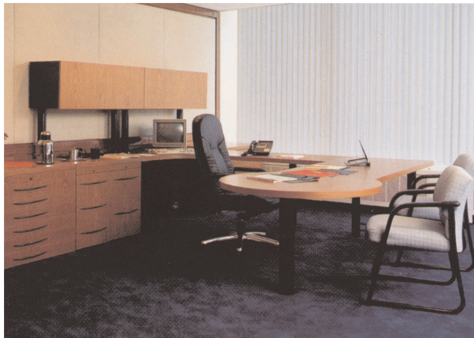
A variety of work surface shapes with upper and lower storage units in light mahogany create a professional office arrangement.