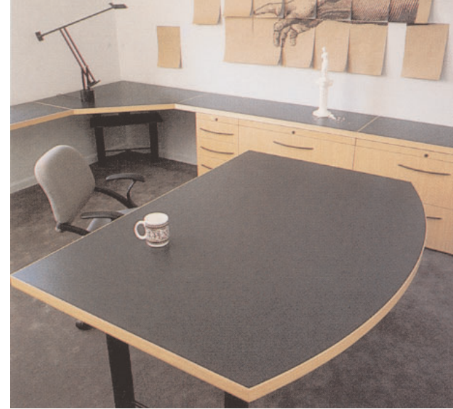
A combination of light ash wood and contrasting laminate worksurfaces results in a distinctive private office.

Using a combination of worksurfaces and upper and lower storage units, every issue can be addressed to create an attractive, functional private office.